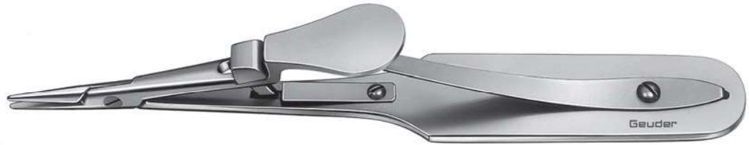
ARRUGA NEEDLE HOLDER 14 mm heavy jaws thumb rest and catch overall length 140 mm straight, smooth jaws curved, smooth jaws