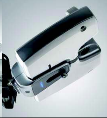
Tiltable Refractive Body