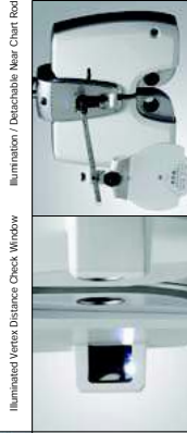
Illumination / Detachable Near Chart Board