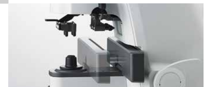
Minimize the Distance between PD Bar and Lens Support